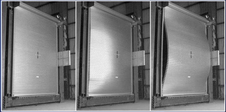
High-speed camera images of PL2 test

PL2 is fitted with a pair of automated bottom restraint device that will work with the motor operator to ensure that the restraints will always engage whenever the shutter is in the closed position. PL2 has been tested and shown to be capable of achieving limited damage and be fully retained in response to a blast load with a peak pressure 40 kPA and peak impulse 500 kPa-ms.