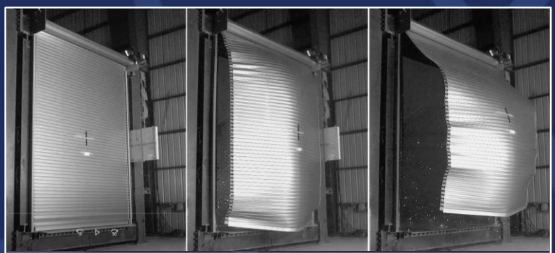
High-speed camera images of PL1 test

PL1 (without bottom restraints) has been tested and shown to be capable of achieving limited damage in response to a blast load with peak pressure 75 kPA and peak impulse 1050 kPa-ms; and